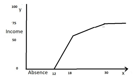
Figure 3. Possible trade off between absence and income percentage. The y-axis represents % income earned in UK, so that increasing values of y favour no change

for a balance between the competing values, and acknowledging that a greater engagement will require a shorter absence to satisfy our notion of equity.